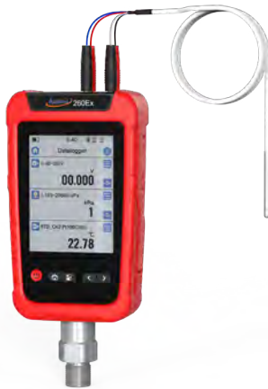
ADT260Ex with AM1602 temperature probe

Note: The ADT260Ex can be purchased without the ADT158Ex module if needed using the following part number: ADT260EX-NO