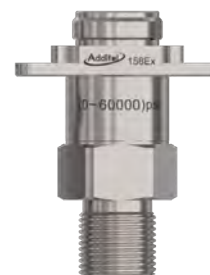
"ADT158Ex pressure module - for use with ADT260Ex (bottom mount)"