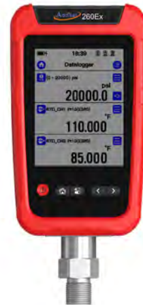
Additel 260EX with ADT158Ex module