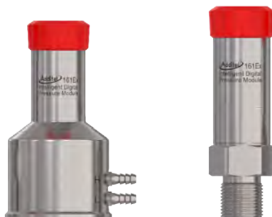
"ADT161Ex pressure modules - See ADT161 Datasheet for more info"

Note: [1] For custom RTD cable lengths over 100 feet (30 meters), which will adhere to Class B, please contact Additel.