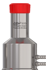
ADT161Ex pressure modules - See ADT161 Datasheet for more info