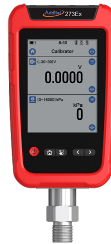
Additel 273Ex with ADT158Ex module